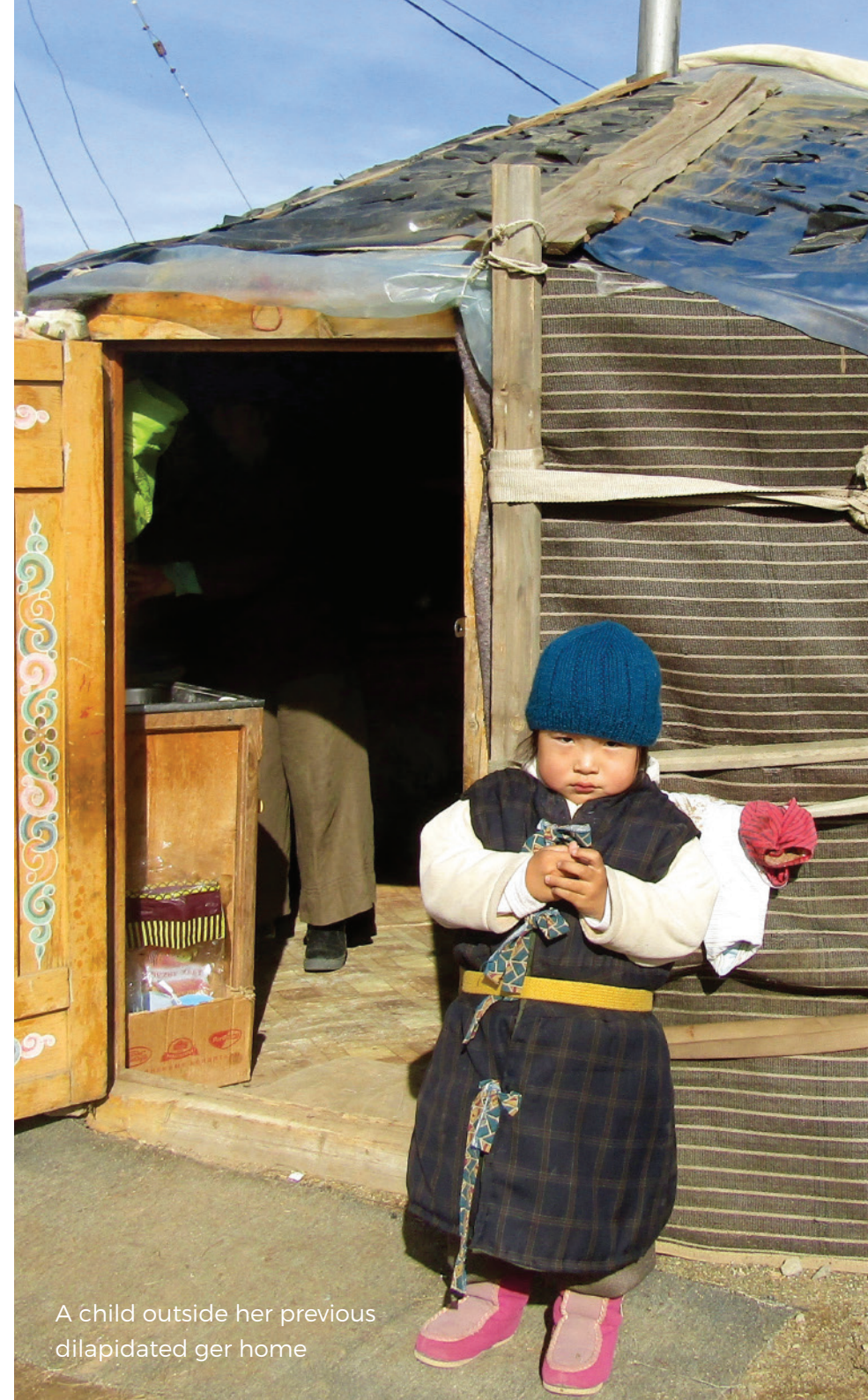
A child outside her previous dilapidated ger home